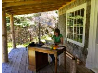
Rebecca Gilman, playwright, first Artist-in-Residence at Bingham Cottage.