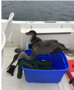
Unceremonious transport of new taxidermy specimens!