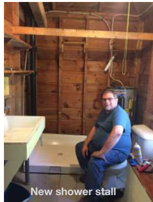
New shower stall