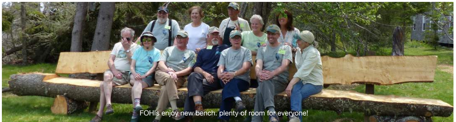
FOHIs enjoy new bench. plenty of room for everyone!