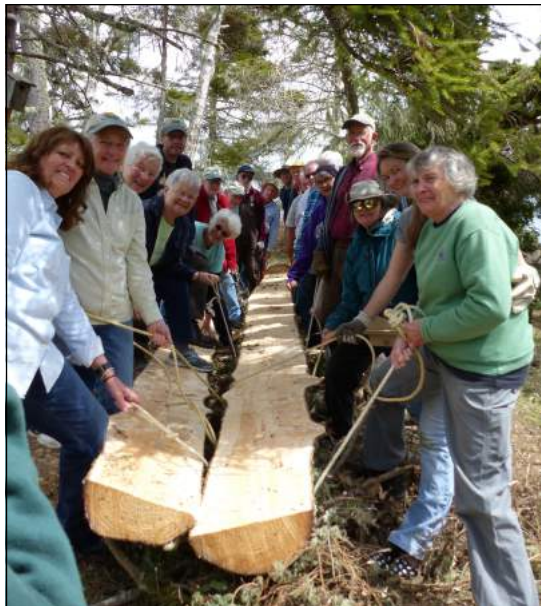
FOHIs: One heart, many hands!

Cover photo: FOHIs pulling together to make the immovable movable! The tree became a bench for all.