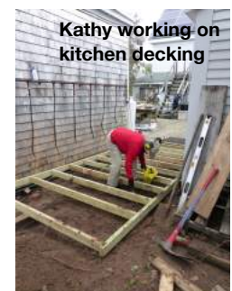
Kathy working on kitchen decking