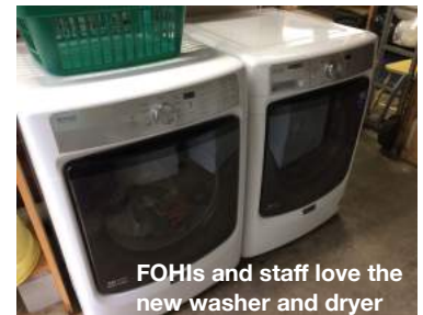
FOHIs and staff love the new washer and dryer

$927,167); $1,345 for a youth scholarship; and bought materials for island projects — a surprise awaits all during the 2019 season thanks to a generous donor and the ingenuity of Eric and the FOHIs! Three new