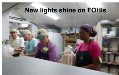
New lights shine on FOHIs